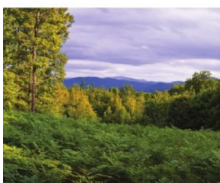
Conserving Your Land Options for New Hampshire Landowners

For questions or more information, please visit our web page at https://www.eknh.org/conservation-commission . Or email us at EKconservation@gmail.com .