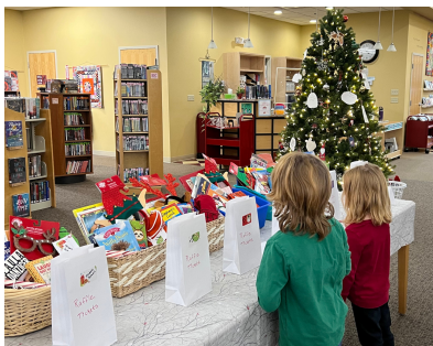
The USB donated books for 7 raffle baskets