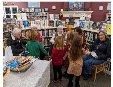
Guests created crafts together, shared cocoa and treats and enjoyed getting to know one another, chatting about favorite books and holiday plans