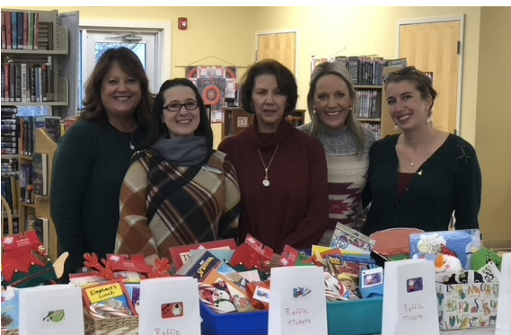
Happy New Year from the FoEKPL Board