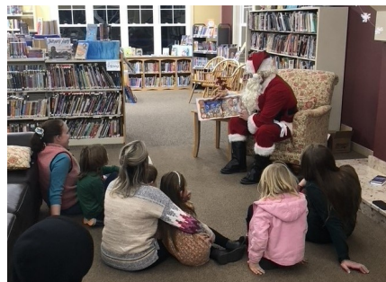
Santa stopped by to share one of his favorite books