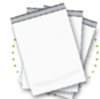
Plastic shipping envelopes