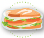
Ziploc & other reclosable food storage bags