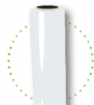
Pallet wrap & stretch film