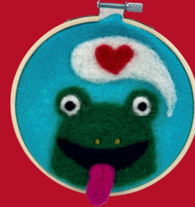
Felting Frog Face